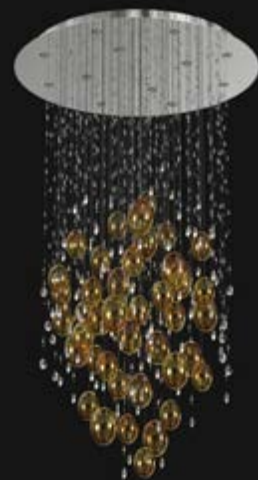
DAWN 02 – CH | 1400x2400 mm 12x20W + 32x10W