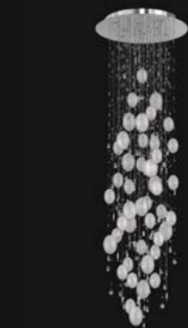
DAWN 03 – CH | 1000x3400 mm 8x20W + 30x10W