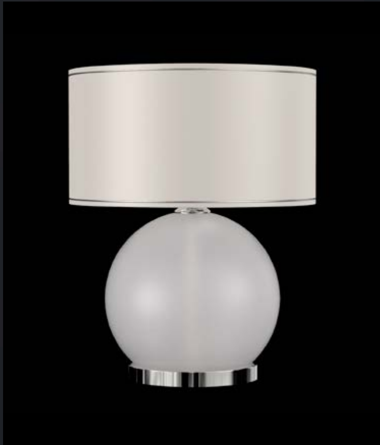
DAWN 01 – TL | 280x350 mm | 1x40W