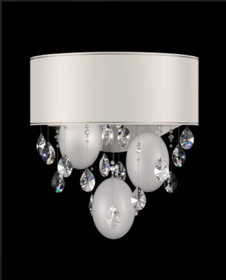
DAWN 01 – WL | 450x480x185 mm | 6x40W