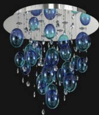
DAWN 01 – CH | 1000x1000 mm 8x20W + 12x10W

This spectacular lighting fixture is inspired by a winter dawn. Its colourful rays and glittering embellishments evoking the last echoes of the night sky will be a stylish complement to your interior. A lighting fixture that lets you feel at one with nature.