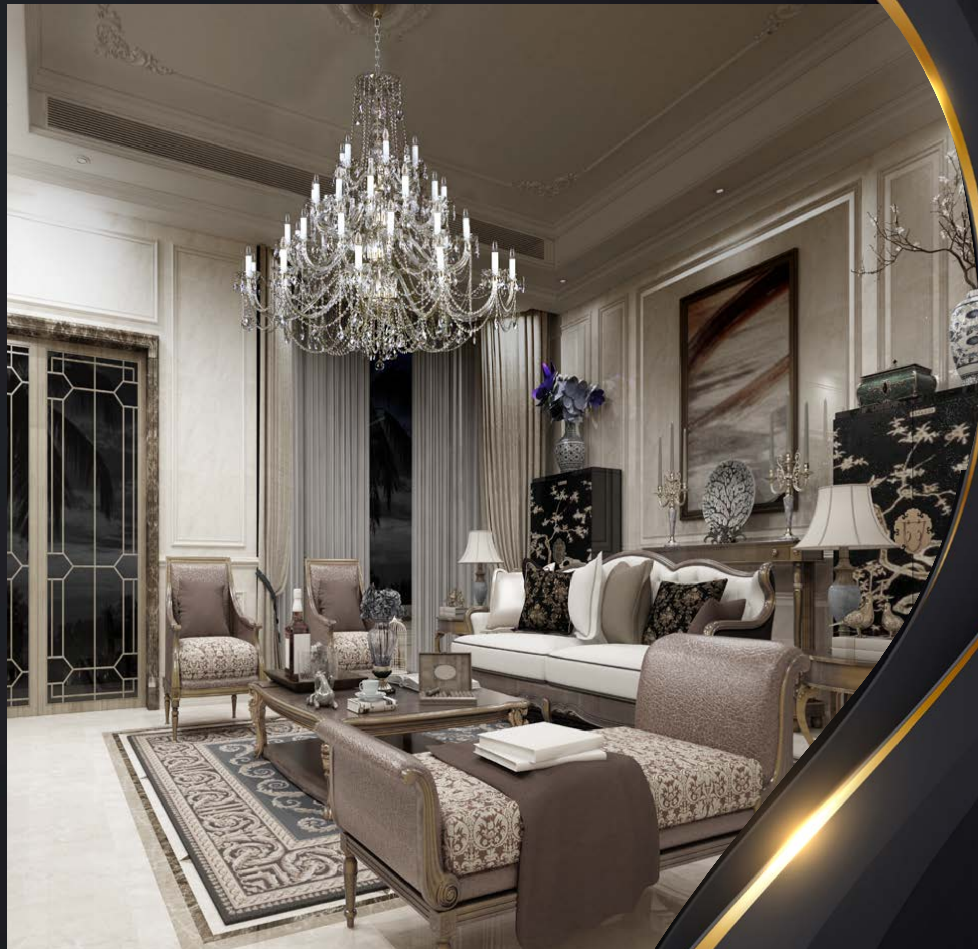
AURELIE 42 | 1530x1560 mm | 42x40 W