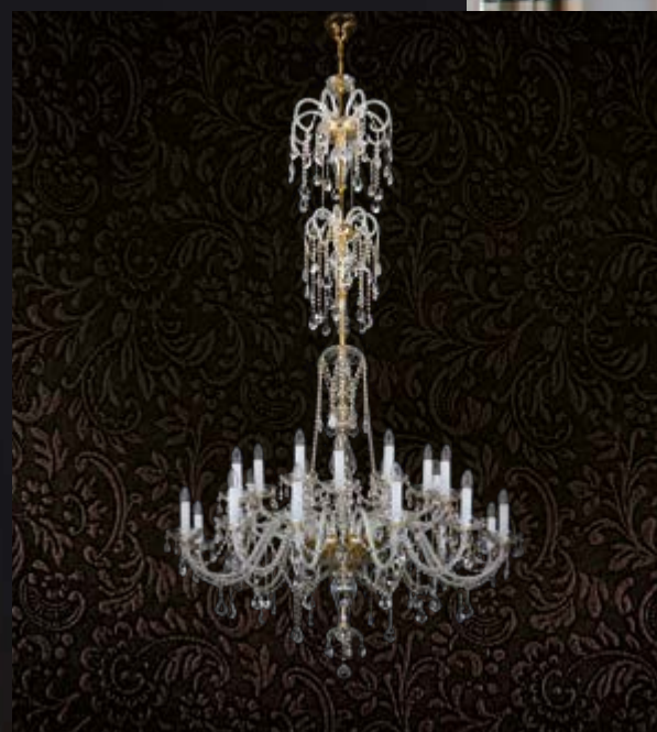
THEODORA XXIV. 1200x2300 1200x2300 mm | 24x40 W