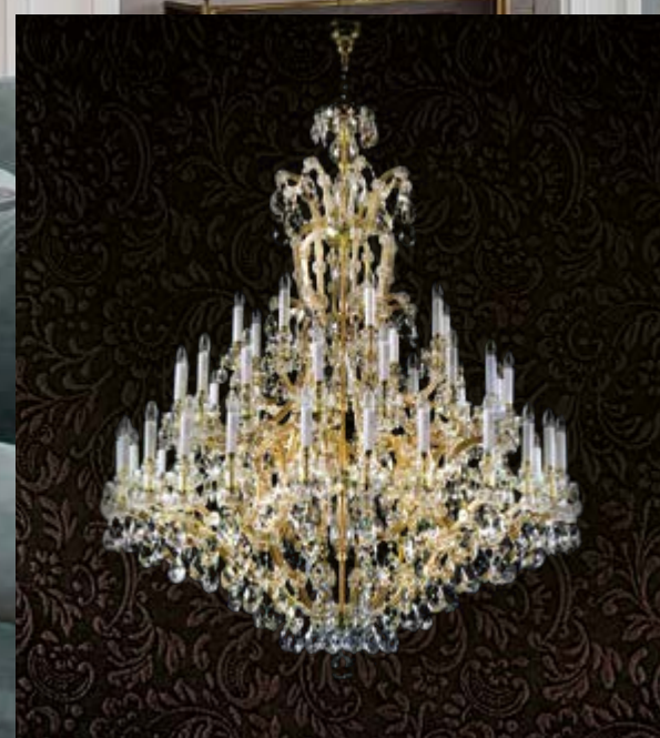
MARIA TEREZIA 19 1600x1800 mm | 48x40 W