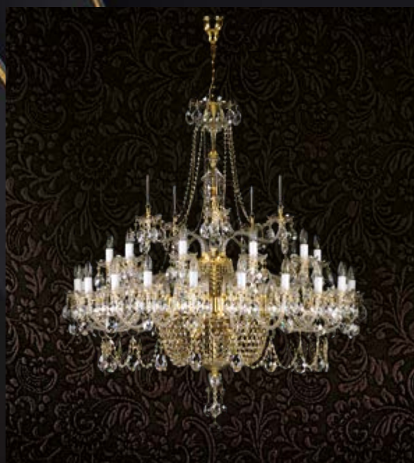
SARA XXX. 1220x1300 mm | 30x40+3x60 W