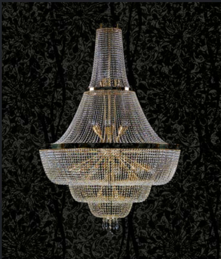
GEMMA dia. 1100 | 1100x1600 mm | 27x60 W