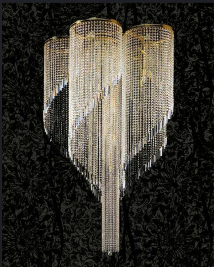
SPIRAL dia. 1200 | 1200x2300 mm | 5x40+15x60 W